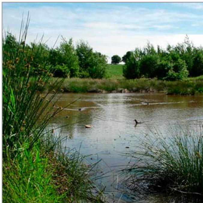
The tranquil pond

The unsurfaced paths are narrow, grass tracks, which can be wet and muddy in places. The boardwalk is approx. 1m (3ft) wide, with no sides or passing places (2).