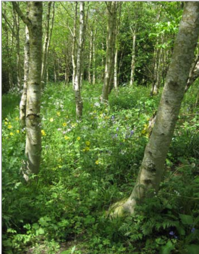
A haven for wildlife

There is one short set of steps (1) with a handrail, although an alternative route is available. Christine's Way, which runs from Boghead Wood into Kirkintilloch, is a fully accessible tarmac path and Lenzie Moss has a fully accessible boardwalk around the site.