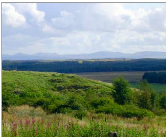
View to the Pentlands