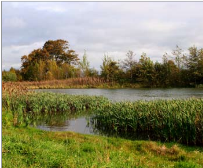
Pond at Easter Breich